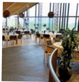
The Nordic House

With our local expertise and in-depth knowledge of the Faroe Islands, we can offer you an experience out of the ordinary.