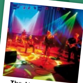
The Nordic House